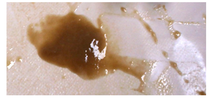
Effective at Biofilm Removal