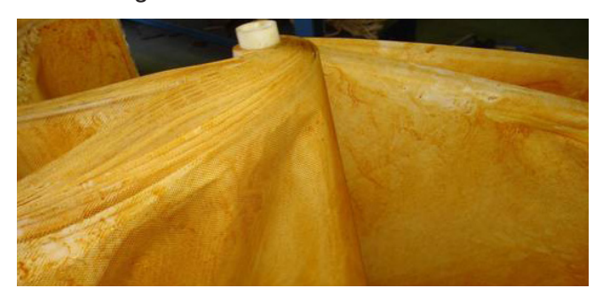
Removes Iron Deposits